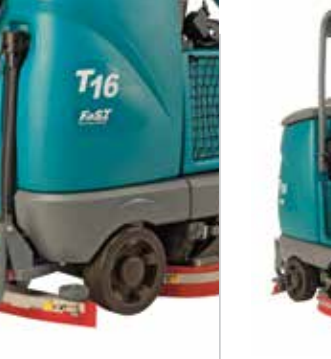
Protect operators from falling objects with the overhead guard and protect the T16 from contact damage with the severe environment front bumper.