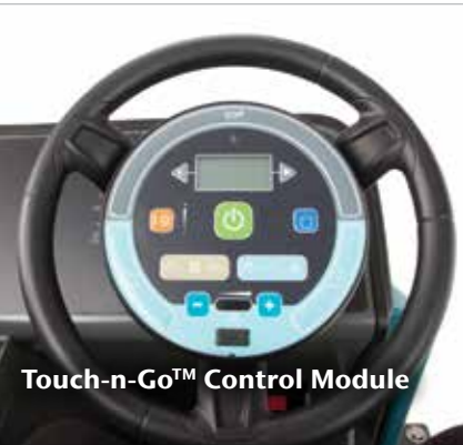
Touch-n-Go™ Control Module

▶ Touch-n-Go™ control module with 1-Step™ start button allows operators quick access to all settings without removing hands from the steering wheel.