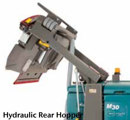
Hydraulic Rear Hopper