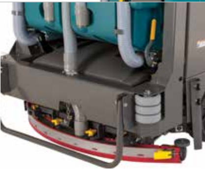
Dura-Track™ Parabolic Squeegee

Overhead guard protects operators from falling objects.