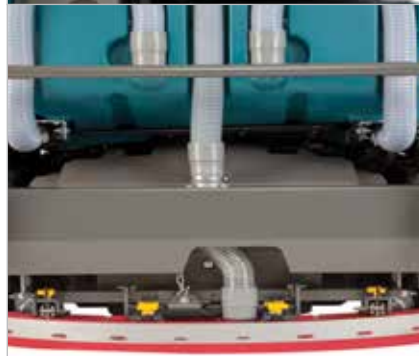
Yellow Maintenance Touch Points